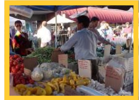
DOWNTOWN FARMER'S MARKET THURSDAYS (WEEKLY)