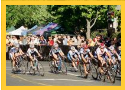
CARRERA DE SAN RAFAEL BIKE RACE JUNE 2007